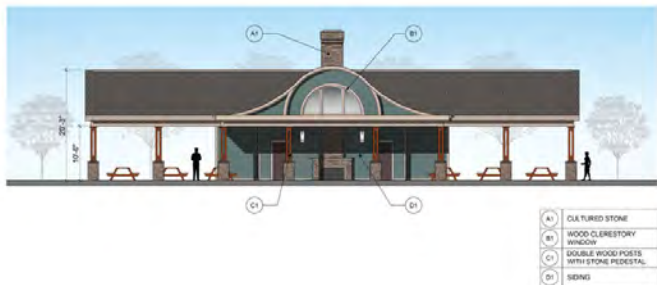
Main Pavilion - South Elevation