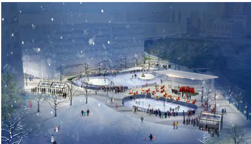
Winter Ice Rink