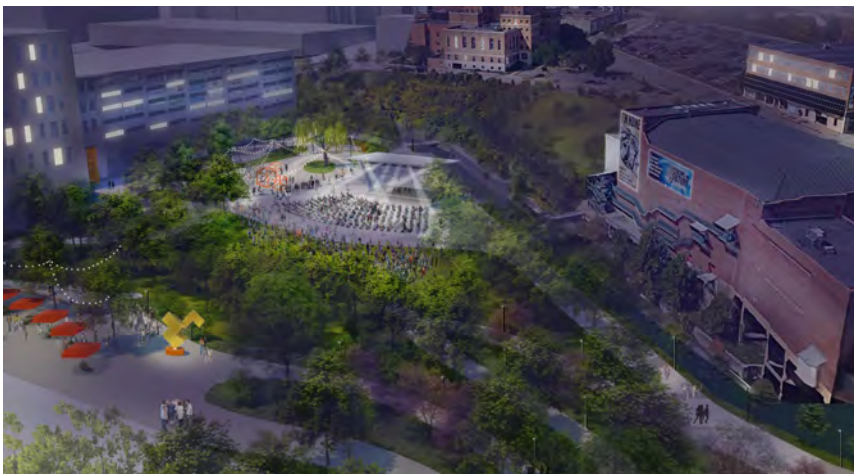
Birds Eye View from Main Street - Night Concert