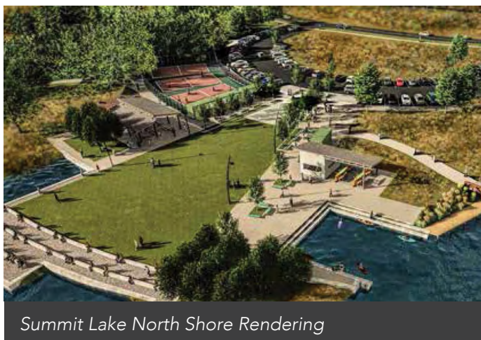
Summit Lake North Shore Rendering